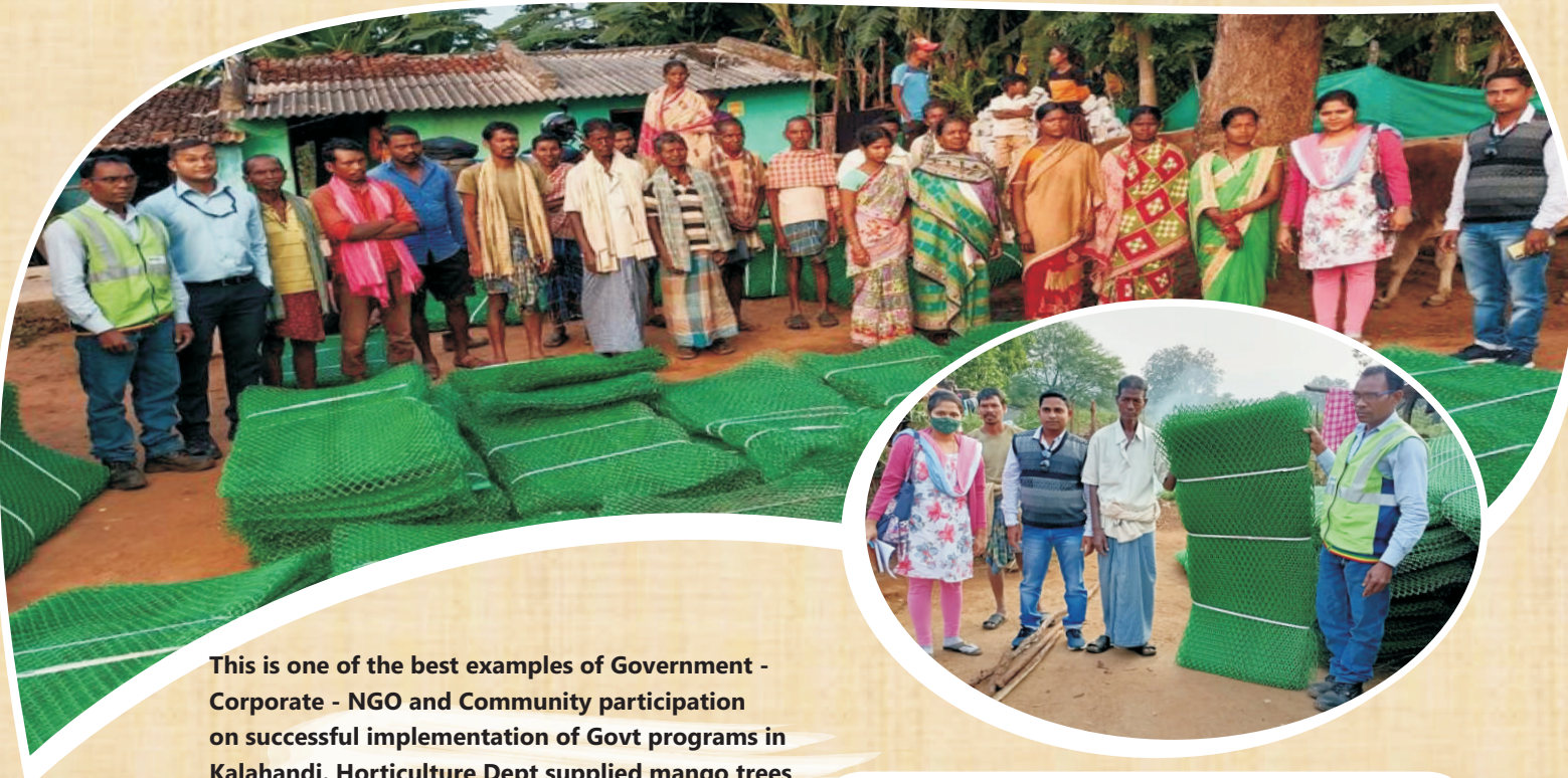
This is one of the best examples of Government - Corporate - NGO and Community participation on successful implementation of Govt programs in Kalahandi. Horticulture Dept supplied mango trees , Vedanta Ltd provided tree guards and Mahashakti mobilised community people for the implementation of the program.