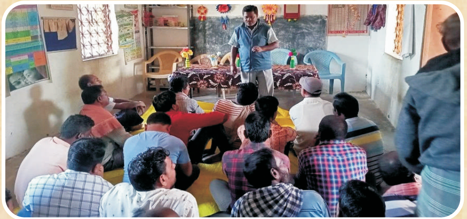
Farmer Mobilisation Activities at Jharbandh Block of Bargarh Dist