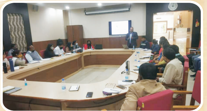
Training on successful livelihood models with team members of Jharkhand State Livelihoods Promotion Society (JSLPS), Govt of Jharkhand at KIIT University – Bhubaneswar