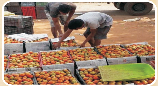
Maa Mahadasni FPO at Loisinga started marketing of tomato to Chhattisgarh and Andhra Pradesh this year. Now farmers are getting their expected price and are getting involved in whole value chain process of the product