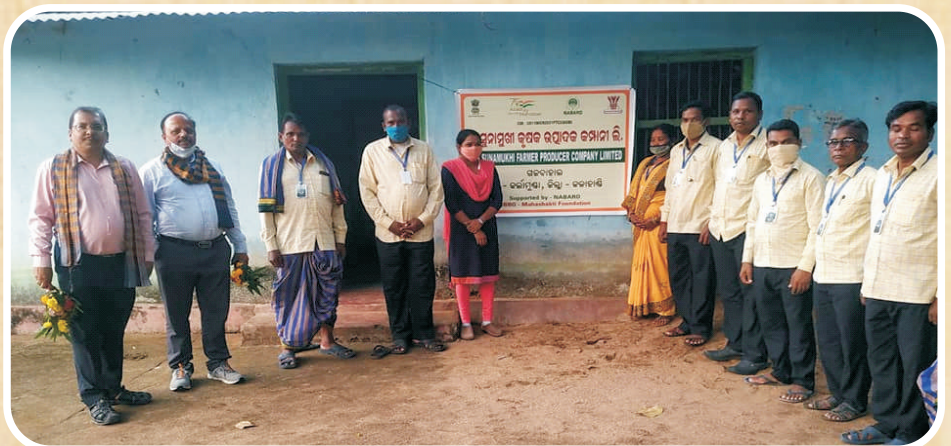
Business Planning Meeting with Maa Sunamukhi FPO, Karlamunda, Kalahandi