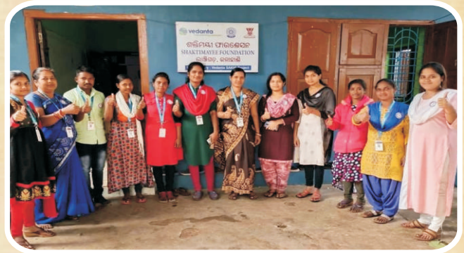
Entrepreneurship training program organized at Shaktimayee Foundation