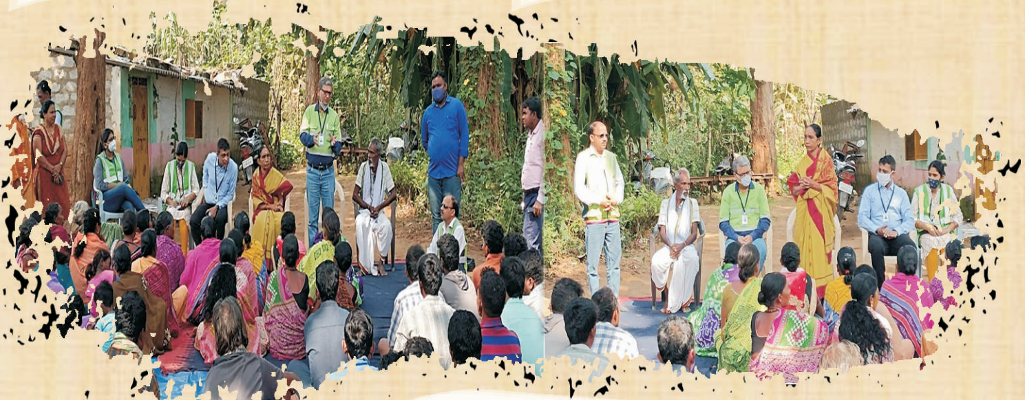
Interaction of Vedanta and PRI representatives with community members to understand the impact of CSR activities and planning for livelihoods development