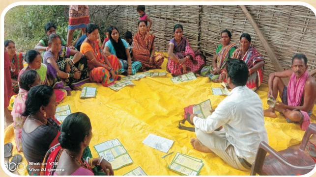
Enrollment of rural people in different Government Schemes