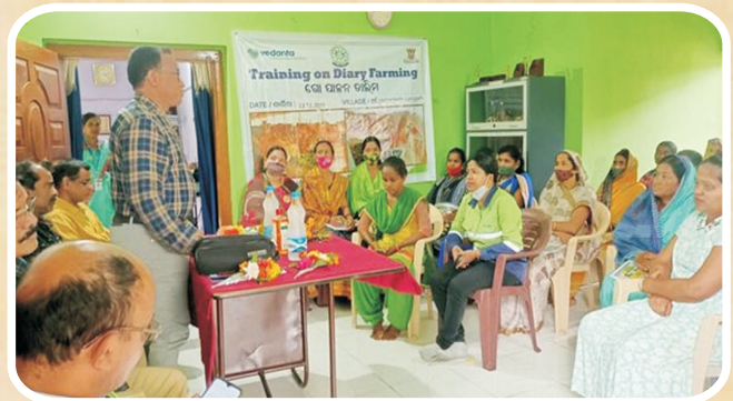
Training Program on Dairy Farming