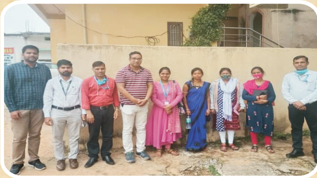
One of our SHG federation, Shaktimayee Foundation signed an MOU with Samunnati to provide Agri Value Chain Financial Services to the farmers of Kalahandi