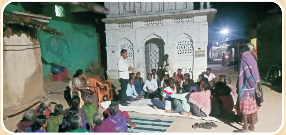
Farmer Mobilisation Activities in Bargarh Dist under central sector scheme for promotion of 10,000 FPOs

In order to double income of farmers by year 2022, Govt. of India (GoI) launched a Central Sector Scheme called Cluster Based Business Organizations (CBBO) for promotion of 10,000 Farmer Producer Organizations (FPOs). In Odisha this scheme is being promoted and administered by NABARD. Under this scheme MSF is acting as an implementing partner of NABARD. MSF has taken the responsibility to form and facilitate 7 FPOs in the districts of Kalahandi, Balangir and Bargarh. From baseline surveys to selection of Board of Directors (BoDs), KYC collections, making individual DSCs, product finalizations etc works have been completed to complete the registration process of all 7 FPOs in their respective districts. All FPOs are functioning with respective BoDs and shareholders.